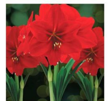
Red Lion Amaryllis Value Kits