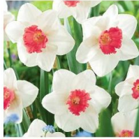
5 Pink Daffodils