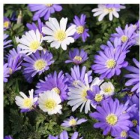
15 Mixed WindFlowers

Bulbs range in price from $8 to $58, with the majority being between $10-$20.