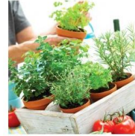
6 Healthy Herb Garden