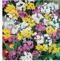
30 Mixed Rock Garden Allium