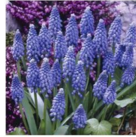
15 Blue Muscari